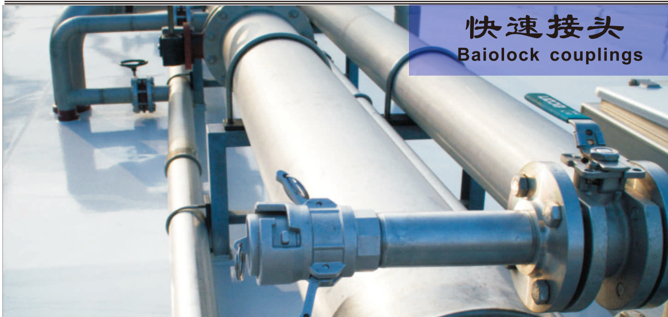
快速接头 Baiolock couplings